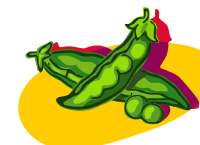
Green Soy Bean

* Read the food label to check if calcium is added!