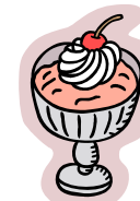
Pudding made with milk