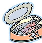
Sardines with bones