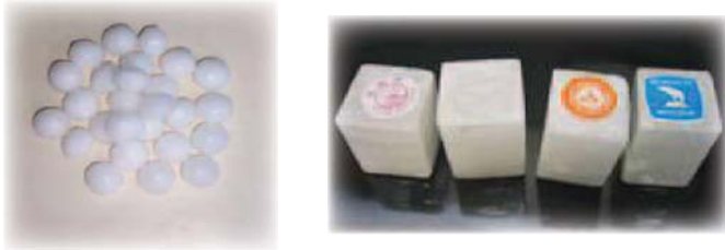
Examples of camphor