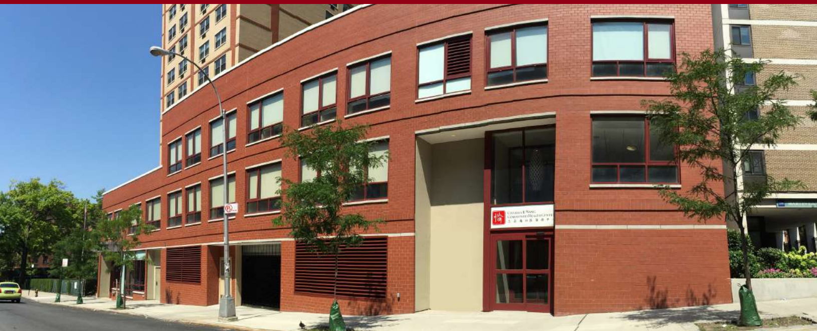
Charles B. Wang Community Health Center site at 137-43 45th Avenue, Flushing.